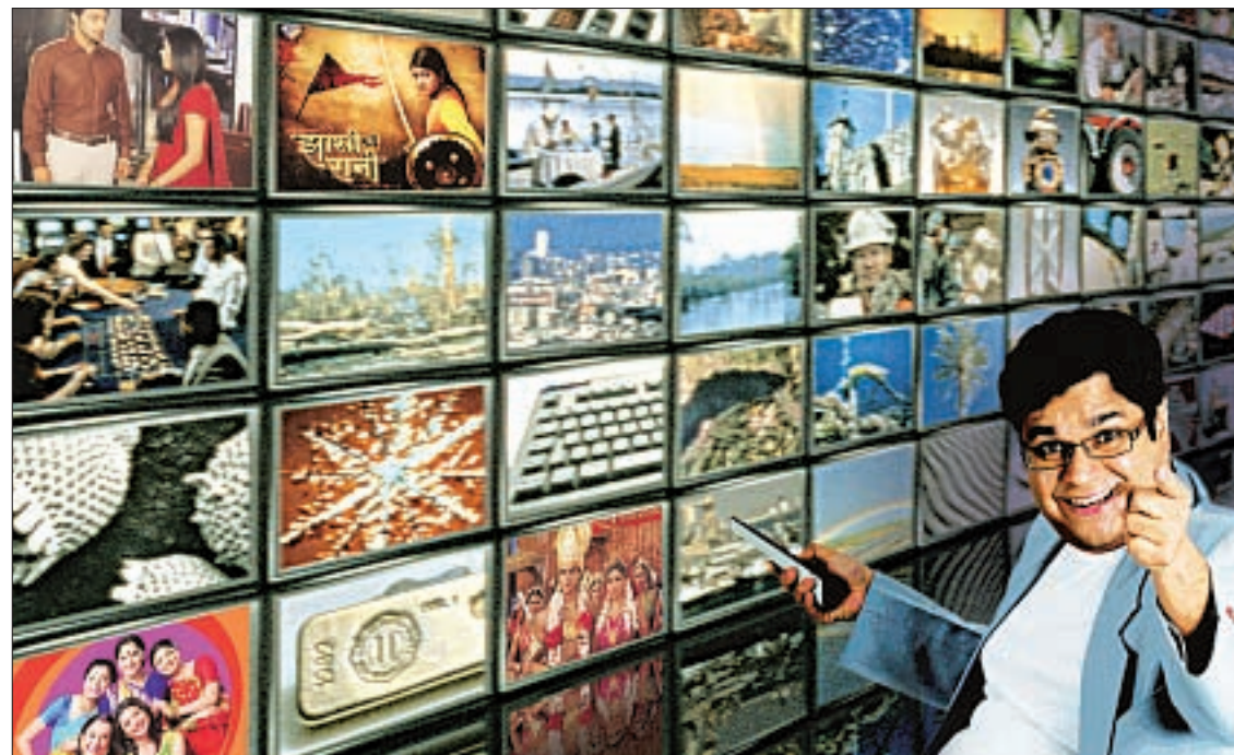
One of the problems with DTH service — and something operators need to tackle — is that rain can disrupt the picture quality.