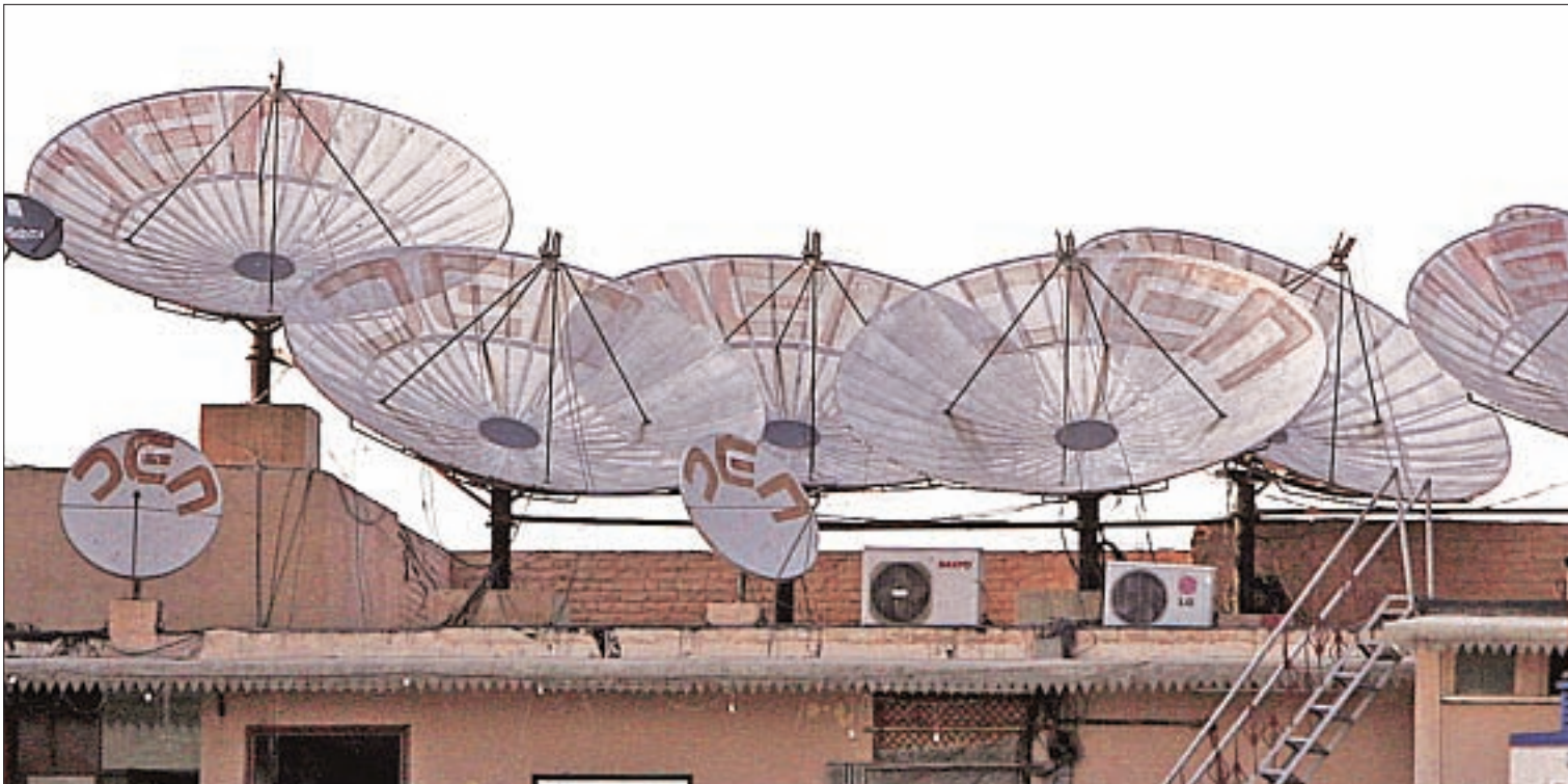
Direct-to-home satellite television has given customers in cities greater choice over what they want to watch.